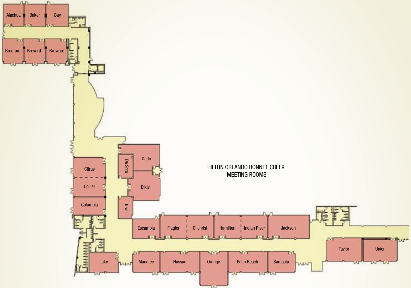
BONNET CREEK BALLROOM